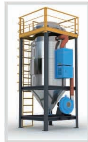
SHD-1500U & Safety Protective Ladder (Option)