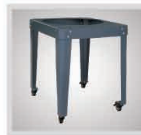
Floor Stand (SHD-20U~750U Applicable)

Support dryer and hopper loader, easy for installation and transportation.