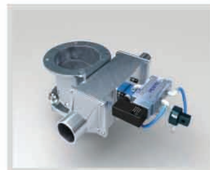
Shut-off Suction Box