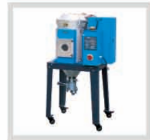
SHD-80U-HD & Floor Stand (Option) & Suction Box